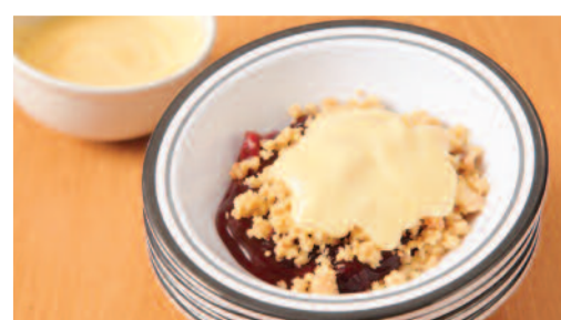
Fruit Crumble & Custard