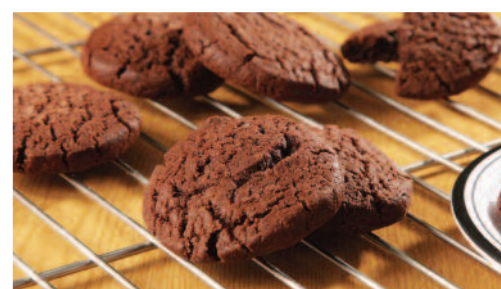
Chocolate & Orange Biscuit