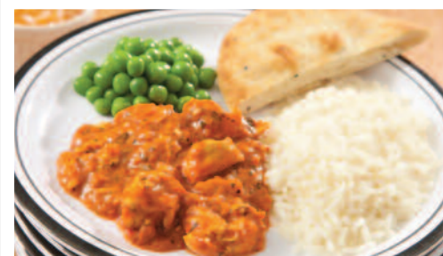
Chicken Tikka Masala served with Rice, Naan Bread & Seasonal Vegetables