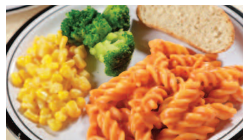
Tomato & Mascarpone Cheese Pasta served with Garlic & Herb Bread and Seasonal Vegetables