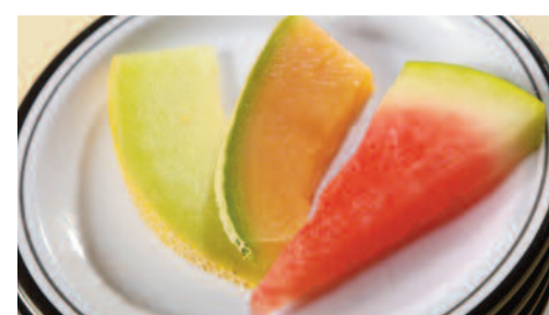
Trio of Melon