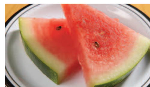
Fresh Water Melon Wedge