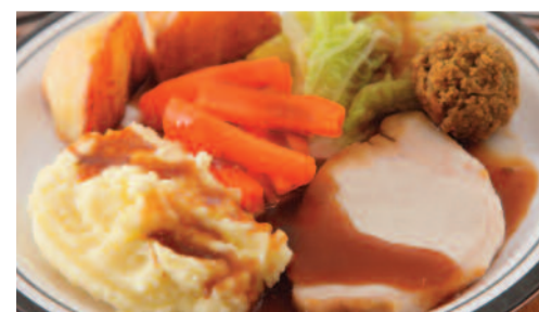
Roast Pork served with Roast/Mashed Potatoes, Seasonal Vegetables & Gravy