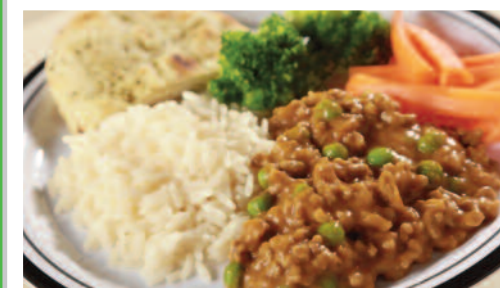
Beef Keema served with Rice, Naan Bread & Seasonal Vegetables