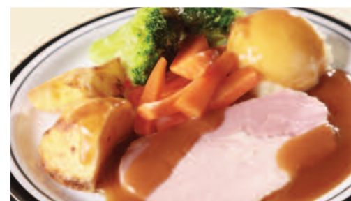
Honey Roast Gammon served with Roast/Mashed Potatoes, Seasonal Vegetables & Gravy