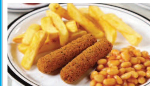
Breaded Mozzarella Sticks served with Chips & Peas or Baked Beans

VEGETARIAN VERSIONS OF THE ABOVE MEAL AVAILABLE DAILY