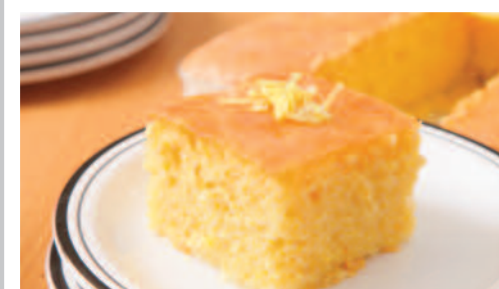
Lemon Drizzle Cake