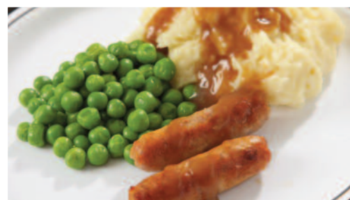
Sausages served with Mashed Potato, Seasonal Vegetables & Gravy