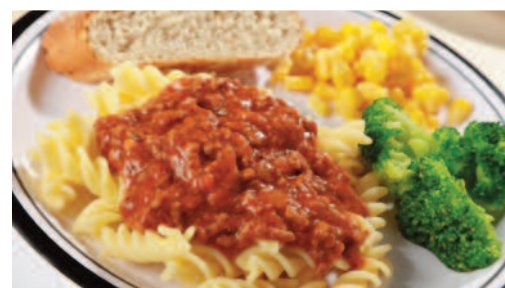
Pasta Bolognese served with Garlic & Herb Bread and Seasonal Vegetables